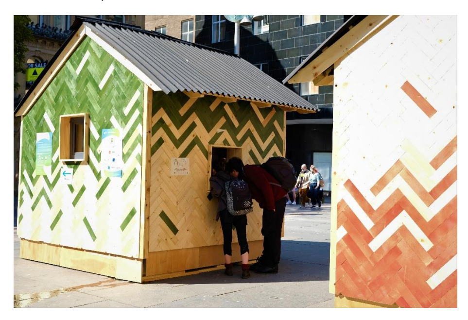
The Ice Box Challenge Glasgow is a public installation and contest taking place from July 23 until August 6. The event demonstrates the benefits of energy efficient buildings.

Passive House buildings stay at a comfortable temperature year round with minimal energy input. They make efficient use of passive heat sources — such as the sun - so that conventional heating systems are rendered unnecessary throughout even the coldest of winters. During the summer, Passive House buildings make use of passive cooling techniques such as strategic shading to keep comfortably cool. To demonstrate how a Passive House building can reduce heating and cooling energy demand by up to 90%, the Ice Box Challenge uses ice to measure how well each box keeps out the heat.