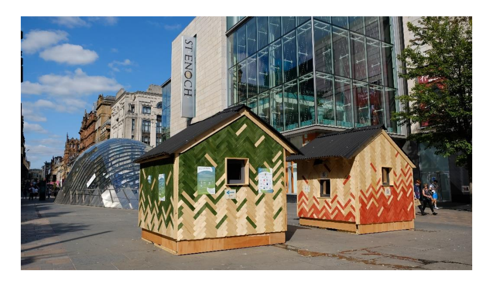
The Ice Box Challenge closing ceremony will take place on Friday, August 6, 2021 in St Enoch Square, Glasgow from 12-1pm