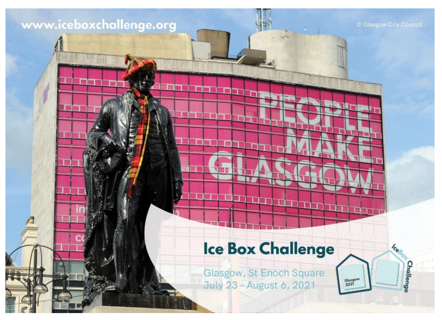
The Ice Box Challenge opening ceremony will take place today, July 23, 2021 in St Enoch Square, Glasgow from 12:30 to 2pm

Press Release 23<sup>rd</sup> of July, 2021