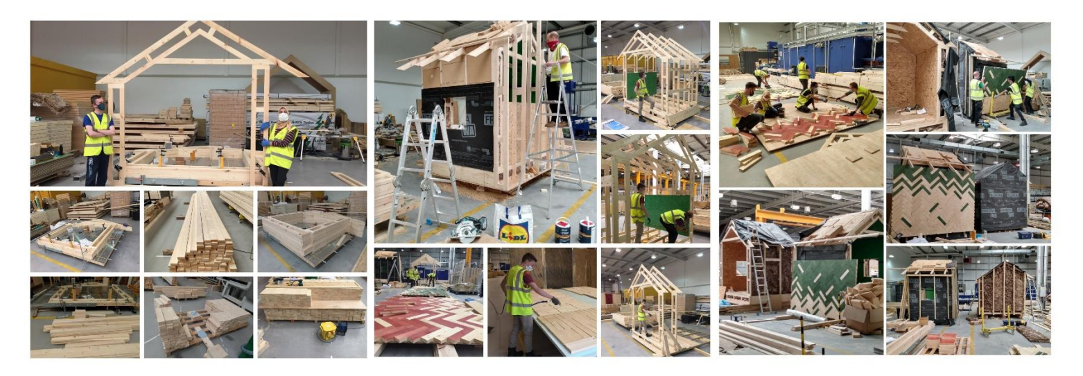
The winning student team from Robert Gordon University have worked with Construction Scotland Innovation Centre to fabricate their ice box design.

The project is a joint effort from the International Passive House Association, Glasgow City Council, Passive House Institute, Edinburgh Napier University, Passivhaus Trust and Construction Scotland Innovation Centre and enjoys the patronage of the UNECE and Global Alliance for Buildings and Construction. The project began with a student design competition, which received entries from all over Scotland and was ultimately won by a team from Robert Gordon University. Their design was inspired by the Scottish Highlands and incorporated design features and materials that would minimise the structures' embodied carbon as well. The team has worked with Construction Scotland Innovation Centre to fabricate the boxes for display.