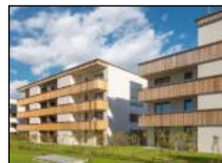
Socially compatible and highly energy efficient: apartment blocks built to the Passive House standard.

Passive House buildings: With the Passive House concept, the typical heat loss in buildings through the walls, windows and roof is drastically reduced. By applying the five basic principles 1. Excellent thermal insulation , 2. Windows with triple glazing , 3. A ventilation system with heat recovery , 4. Avoidance of thermal bridges , 5. An airtight building envelope , a Passive House building needs very little energy for heating and cooling and can dispense with a traditional heating system.