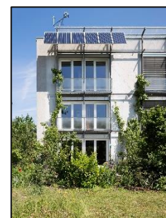
In 2021, the world's first Passive House building in Darmstadt celebrated its 30 th anniversary!

Passive House and renewable energy: The Passive House standard and generation of renewable energy directly on-site or near the building is an excellent combination. The Passive House Institute has therefore introduced the building classes Passive House Plus and Passive House Premium . The world's first Passive House building in Darmstadt also generates renewable energy with a photovoltaic system subsequently installed in 2015 and therefore received the Passive House Plus certificate.