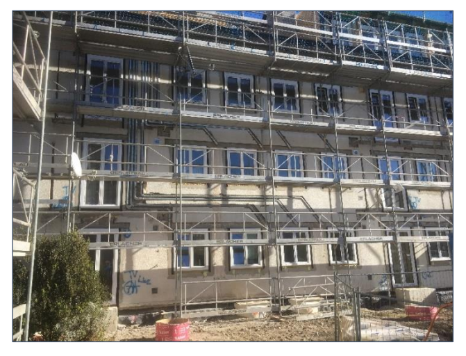
In this building's modernisation, the supply air and extract air ducts for the ventilation system were integrated into the façade. This reduced the amount of work necessary in the apartments, resulting in more tenants giving their consent for this energy retrofit in Innsbruck.

that the heating demand of the retrofitted buildings has already been reduced by around 77 percent. "Once all the apartments have been retrofitted, savings up to 85 percent will be possible," says Peper.