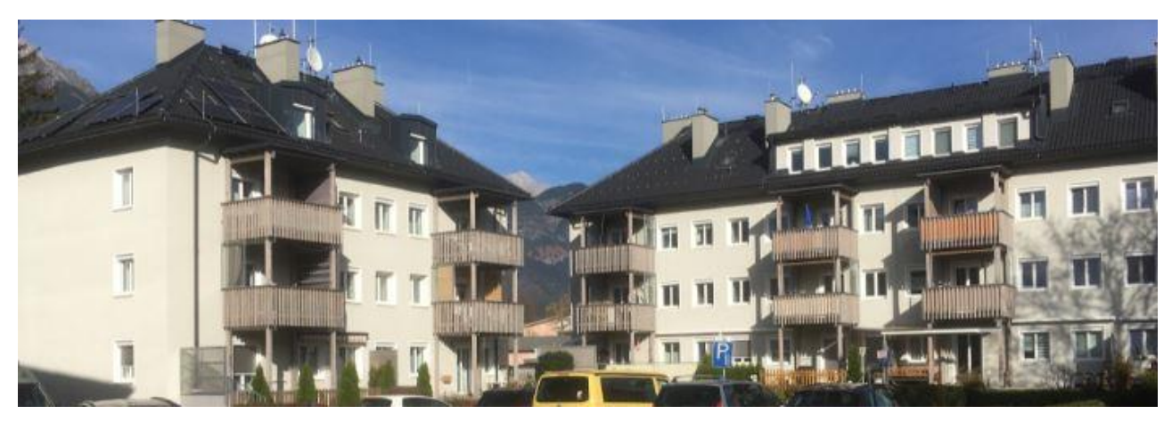
SINFONIA demonstrates that complex buildings and city districts can be modernised to a high standard of energy efficiency in a step-by-step process. In Innsbruck (Austria), the EU-project has funded the deep retrofits of 33 buildings between 2014 and 2020.