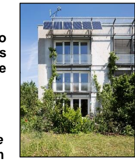
In 2021, the world's first Passive House building Darmstadt celebrated its 30th anni- versary!

Passive House Austria / iPHA: The purpose of the German language network Passive House Austria and the international Passive House Association (iPHA) is the dissemination of knowledge relating to highly energy efficient construction and retrofitting as well as networking.