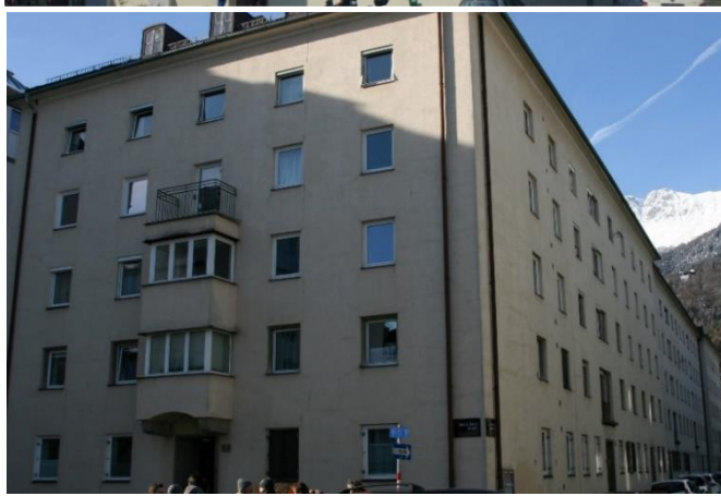
This apartment building in Innsbruck received not only good thermal insulation but also an extension as part of the SINFONIA refurbishment (view below before refurbishment).

retrofitted in Innsbruck alone, including a district with 16 buildings and three schools. The existing buildings were built between 1940 and 1960. The Passive House Institute, with its offices in Darmstadt as well as Innsbruck, provided support for these retrofitting projects and, among other things, carried out the quality assurance relating to their energy performance. In Innsbruck, the energy demand projected using the PHPP energy calculation tool in the planning phase was very consistent with the low consumption values measured later in the retrofitted buildings (SINFONIA Research Report). Other SINFONIA partners managed the projects in Bozen in Italy.