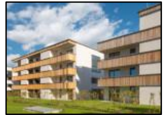
Apartment blocks to the Passive House standard.

"The time window remaining to us becomes smaller and smaller the longer we defer protection of the climate and adaptation" – this is what Hans-Otto Pörtner of the UN Climate Council IPCC had to say in February 2022. Solving the problems of supply security and climate protection in the building sector means highly energy efficient new constructions and retrofits. This is how the existing building stock will become climate-neutral!