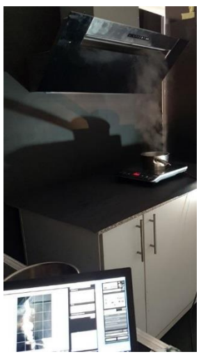
The experimental setup for vapour collection in the

In view of greater energy efficiency of buildings and increased demand for thermal comfort by