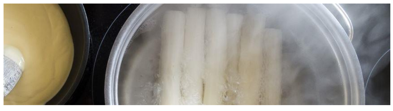
The Passive House Institute closely examined different extractor hood systems especially in airtight buildings. The scientists also examined the minimum extract air volume that is necessary for collecting a specific amount of vapours (fumes).