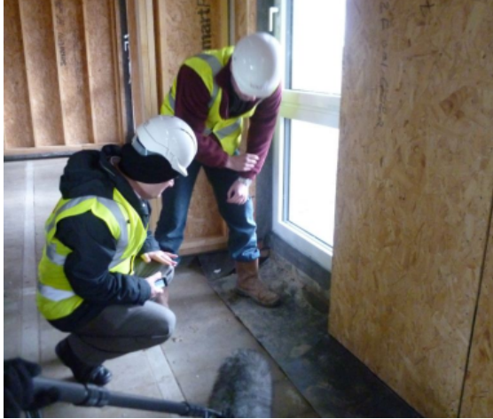
A visit to a Passive House construction site in the town of Fulmodeston in Eastern England.