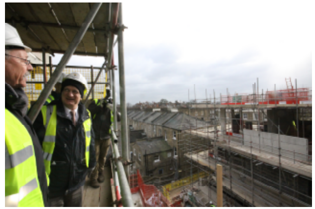
A total of 53 Passive House apartments will be created in London's Camden district.

Press contact: Benjamin Wünsch | Passive House Institute | +49 (0)6151-82699-25, presse@passiv.de