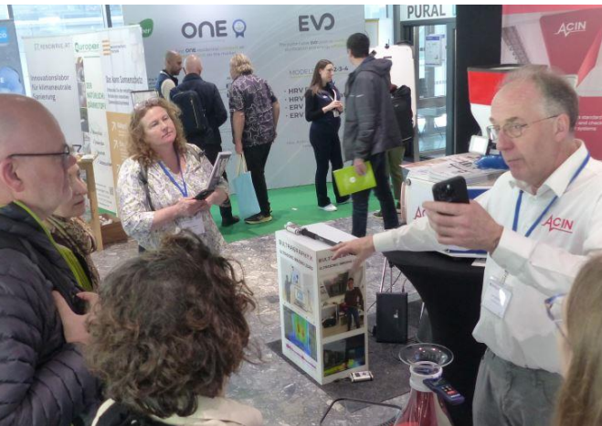
At the event venue, participants had a good view of Innsbruck's mountain panorama (left). At the Passive House exhibition, companies presented their components for highly energy-efficient construction and refurbishment to an international audience of experts from 42 countries (right).