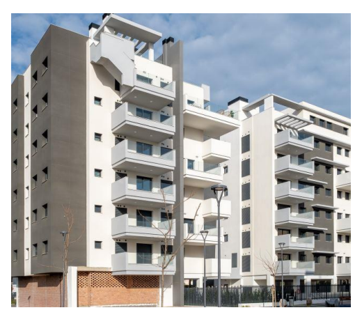
In Malaga in southern Spain, the planners of this Passive House complex implemented comprehensive protection against overheating because of the high summer temperatures.

Various monitoring projects demonstrate that high energy efficiency also works very well in the long term. Studies carried out relating to a renovated school in France, a Passive House sports hall in Paderborn built 15 years ago, and a detached house in Lithuania prove that the buildings continue to have low energy demands and that the components have a long service life. This is also confirmed by ten projects in the UK, which were re-assessed ten years after their extensive modernisation.