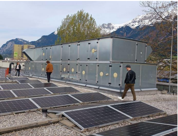
The elementary school Neuarzl in Innsbruck achieved the EnerPHit standard following a retrofit. The advantages are a greatly reduced heating demand and significantly increased thermal comfort for all users in both winter and summer. A large-scale PV system and a ventilation system are installed on the roof.