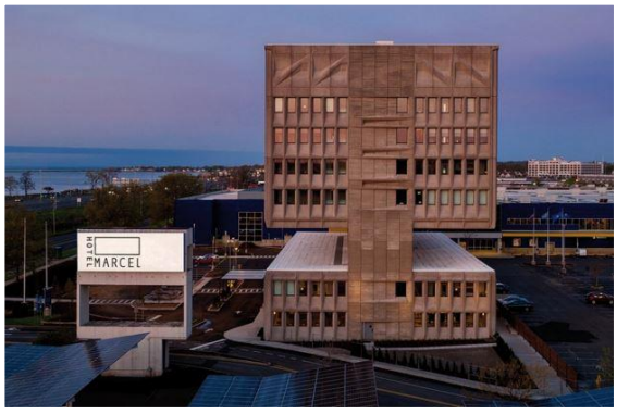
Top: Passive House new build of the municipal housing development company Neue Heimat Tirol with more than 150 apartments and a kindergarten in Innsbruck. Centre: Evening event during the 27th International Passive House Conference. Bottom: The striking former office building in Connecticut, USA, is now a climate-friendly hotel.