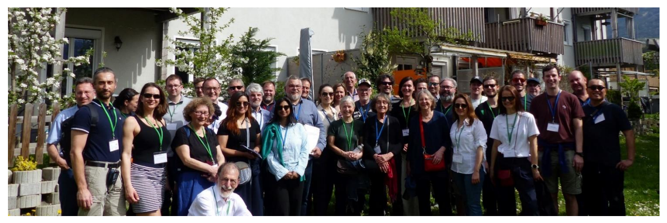
Group photo in front of the successfully completed SINFONIA project in Innsbruck: with its four excursions, the 27<sup>th</sup> International Passive House Conference offered to view highly energy-efficient projects in detail.